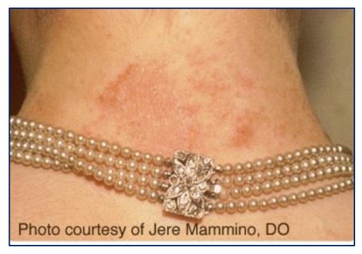
Nickel ACD from nickel releasing necklace clasp.

Many chemical agents such as poison ivy, rubber accelerators, epoxy resins, certain solvents, certain perfumes, and some metals and soluble salts of metals ( e.g. , nickel, chromium, cobalt, gold, mercury) are able to cause ACD. A broad range of skin symptoms ranging from dryness, chapping, and inflammation to eczema and blisters characterizes this condition. Discomfort is caused by skin inflammation and itching.